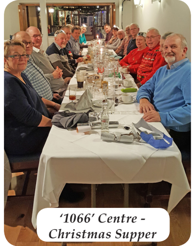
'1066' Centre - Christmas Supper